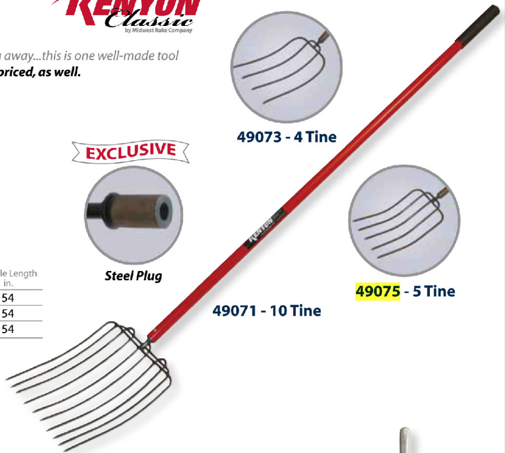
49071 - 10 Tine